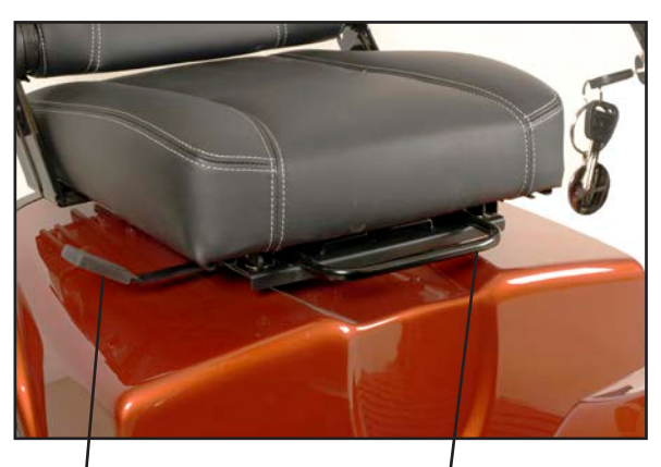
Release lever for seat rotation. Release lever for seat forward/back.

Other seats that can be supplied for the Mini Crosser work on similar principles. The release lever is normally located on the right, but can be put on the left if so wished.