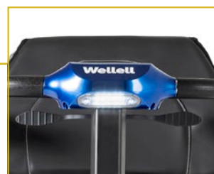
Front LED light