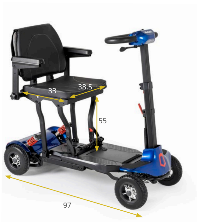
Measurements in cm