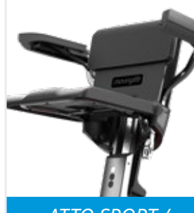
ATTO SPORT / SHABBATTO Armrests