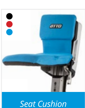
Carryall & Cushion