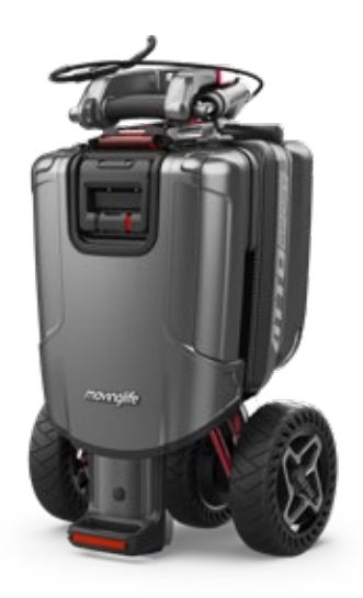
SPLIT MODE Separates into 2 lightweight parts

COMPACT MODE Folds into a small suitcase size