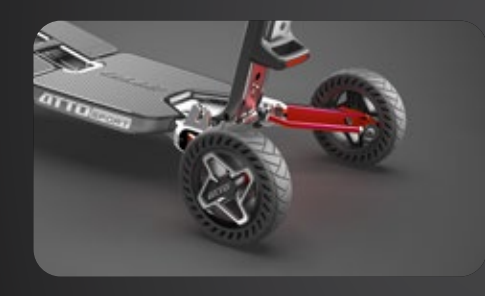
Extra wide rear wheel space offers better stability