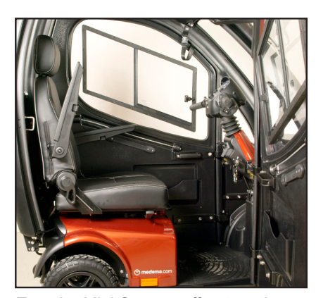
Turn the Mini Crosser off, return the steering column to upright position and raise the armrest.

To restart the vehicle, the key must be turned to stop position (0) and then to driving position (1).