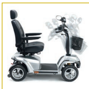
Driving column adjustable