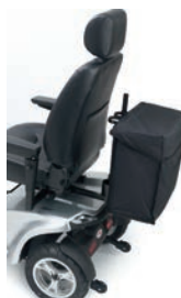
Rear bag with cane holder