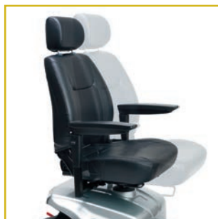
Swivel and depth-adjustable seat