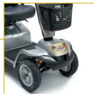
Front suspension. With brake, front, flashing and emergency lights