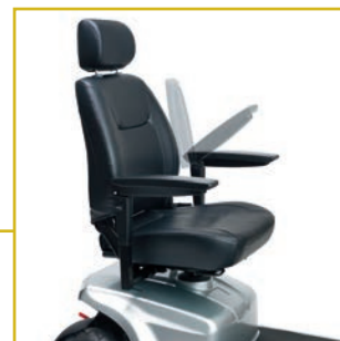
Folding armrests adjustable in height and width