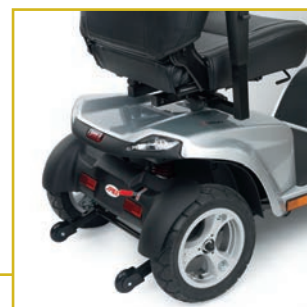
Rear suspension. Release lever and anti-tip wheels