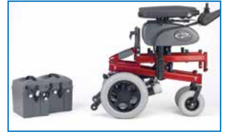
Easy to store or transport

An easily detachable back and lift out batteries, combined with a folding frame and the fact that the heaviest component of the chair weighs just 37.4kg (82.4lbs) makes the Rumba easy to transport, or to store in car boots or other confined spaces.