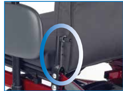
Height and angle adjustable backrest