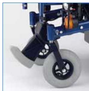
Kerb climber (standard)